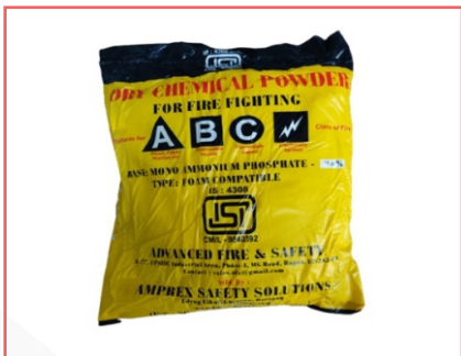
AFS ABC TYPE ISI MARKED POWDER