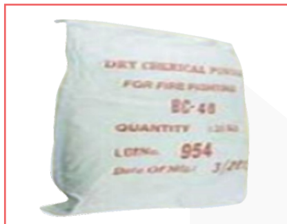
AFS BC TYPE ISI MARKED POWDER