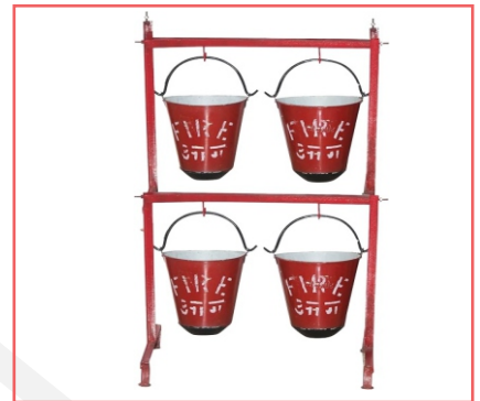
FIRE BUCKET STAND