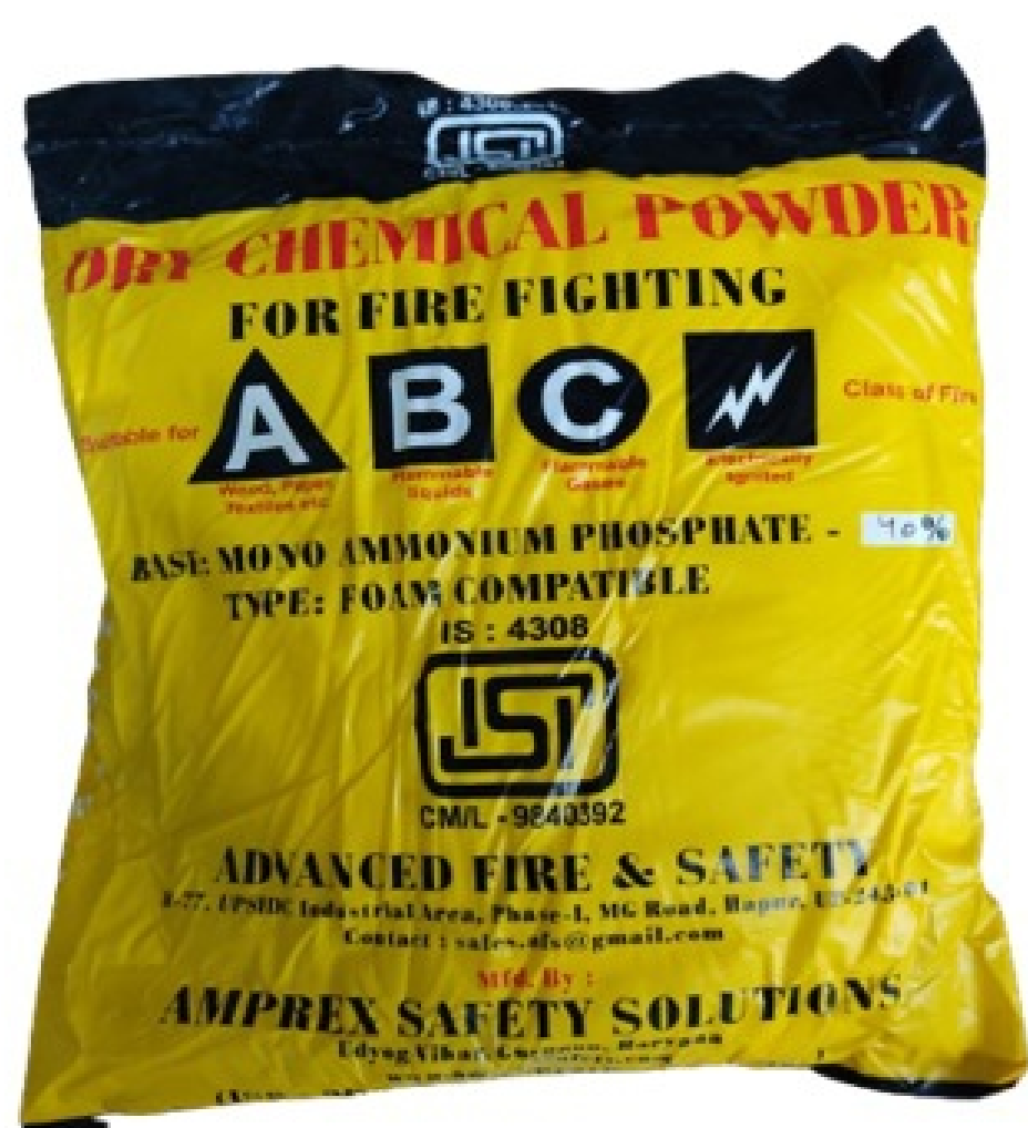
AFS ABC TYPE ISI MARKED POWDER