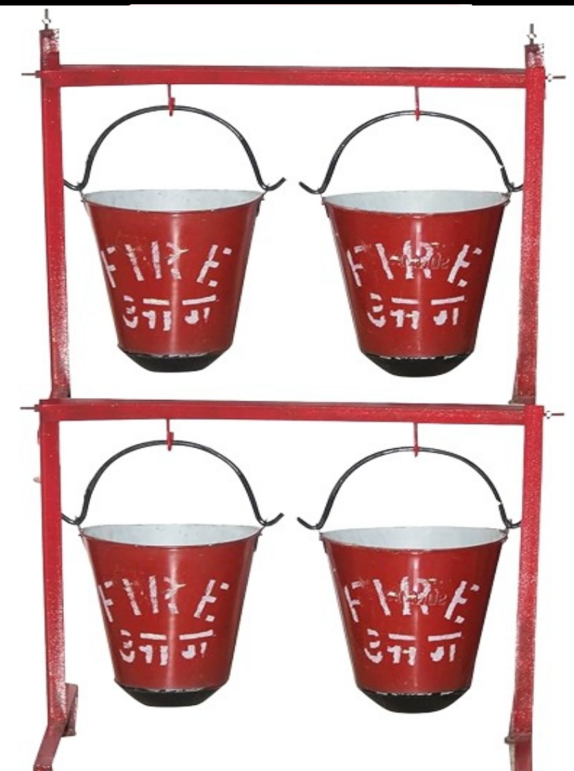
FIRE BUCKET STAND