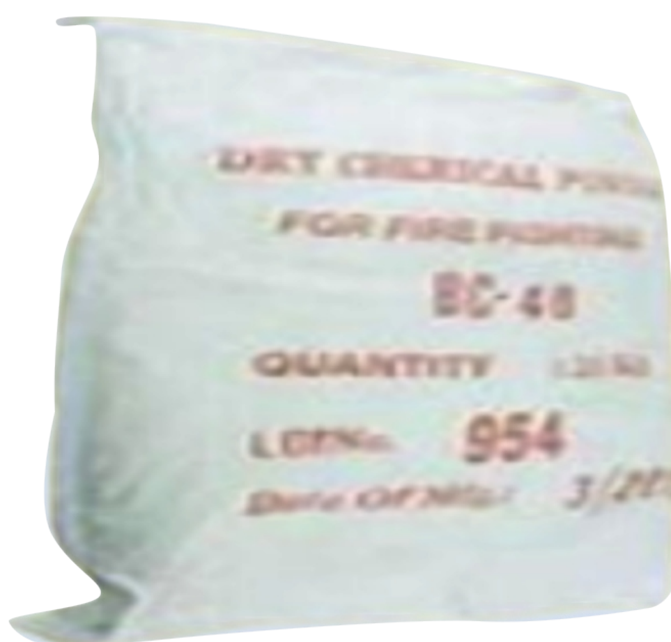
AFS B-C TYPE ISI MARKED POWDER